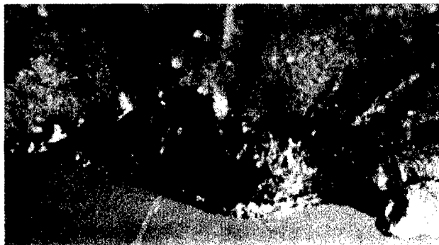
H225-Loss of upper longitudinal speed trim actuator bolt from aft rotor swashplate attaching lug caused by failure to safety upper nut on pin.